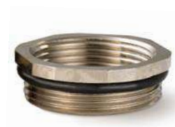
Convertidor de rosca de latón niquelado